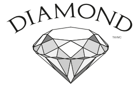
Diamond Lager Yeast vs. Cream Yeast (same strain)